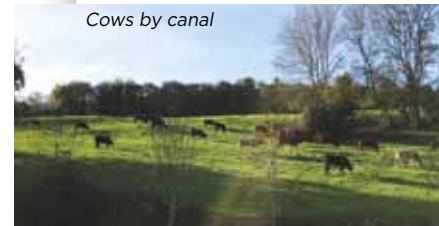
Cows by canal