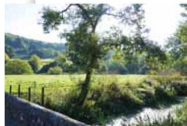
Warleigh Weir Field