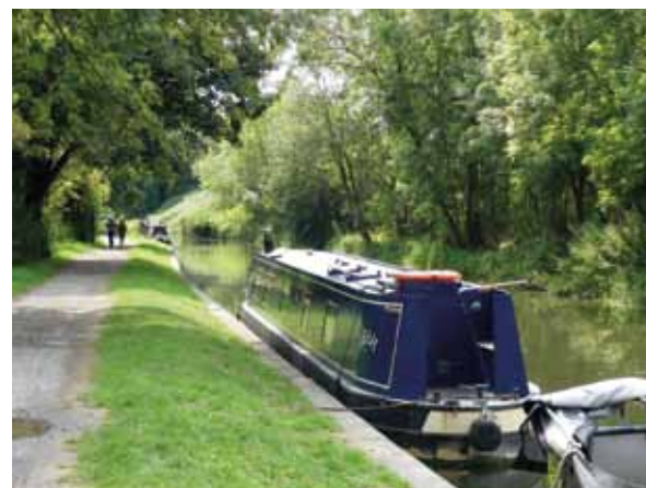
Canal & towpath

Further references see Appendices II, III VI & VII