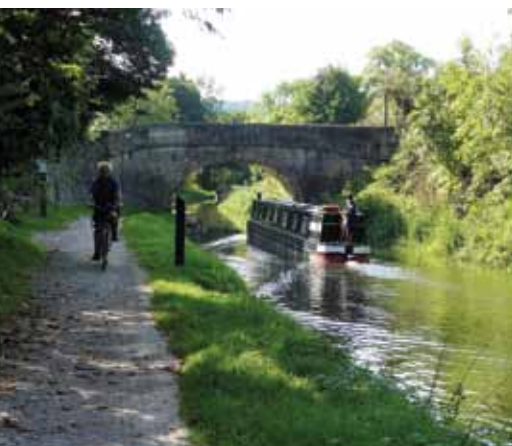
Cyclists, Boat & Bridge