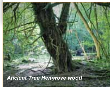
Ancient Tree Hengrove wood