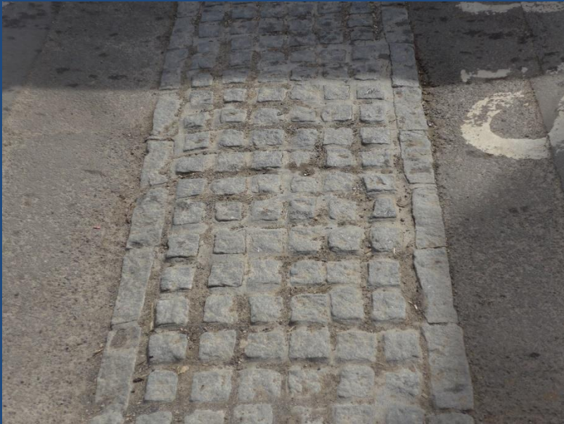
Rumble strips (Wellow)